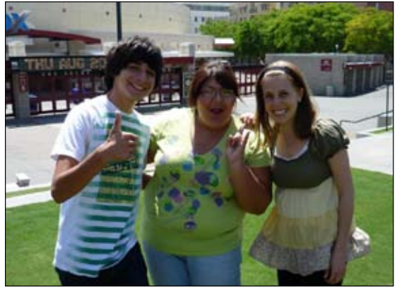
Proudly serving the San Diego American Indian Community for 16 years